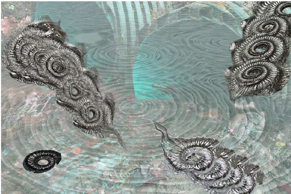
Visual by SHELL LIKE (2021).